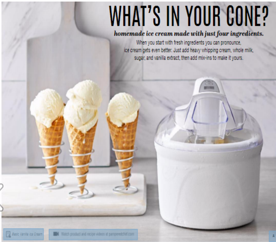
Basic Vanilla Ice Cream

When you start with fresh ingredients you can pronounce, ice cream gets even better. Just add heavy whipping cream, whole milk, sugar, and vanilla extract, then add mix-ins to make it yours.