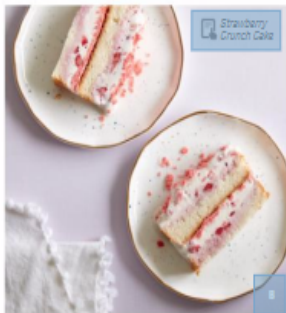
Strawberry Crunch Cake