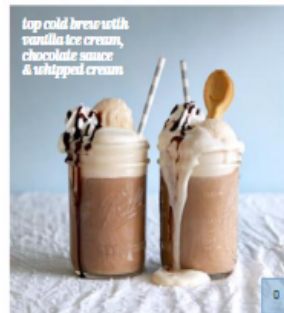
top cold brew with vanilla ice cream, chocolate sauce & whipped cream